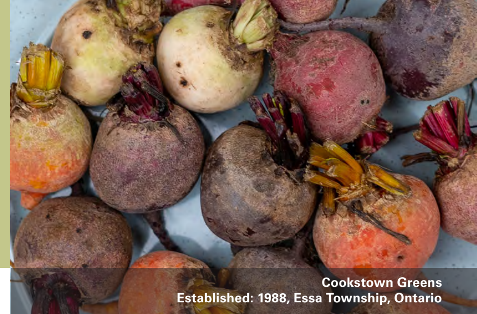
Cookstown Greens Established: 1988, Essa Township, Ontario